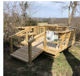
Sotterley's new eagle overlook!