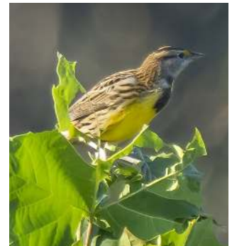
Eastern Meadowlark in a sycamore tree at Historic Sotterley.