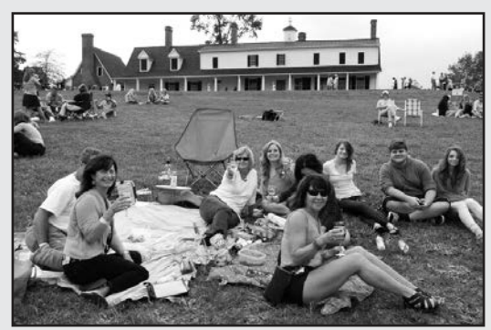
Not a Member? Not a Problem! Join Today!

You are invited to join fellow Members in the Sotterley Spinning Cottage during WineFest. This charming building is located just steps away from the Plantation House and provides the ideal sanctuary for Members to relax during WineFest. The cottage is equipped with a private restroom, climate control, and a place to sit and relax. Make sure you stop by for some light refreshments and a chance to visit this special historic building, which is normally not open to the general public.